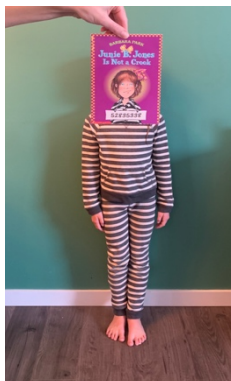
"Junie B. Jones is Not a Crook" by Barbara Park

Junie leaves her new mittens by a tree and when she comes back, they are gone. She then finds a fancy pen and decides if someone took her mittens, then she could take the pen.