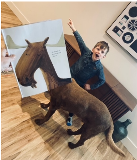
"This Moose Belongs to Me" by Oliver Jeffers.