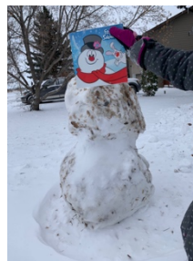
"Frosty the Snowman"